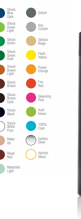
15MM STANDARD /24 COLORS + VARNISH